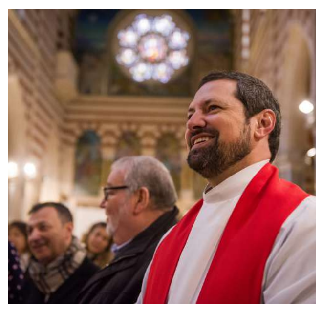
BISHOP-ELECT AUSTIN RIOS AT ST. PAUL'S-WITHIN-THE-WALLS