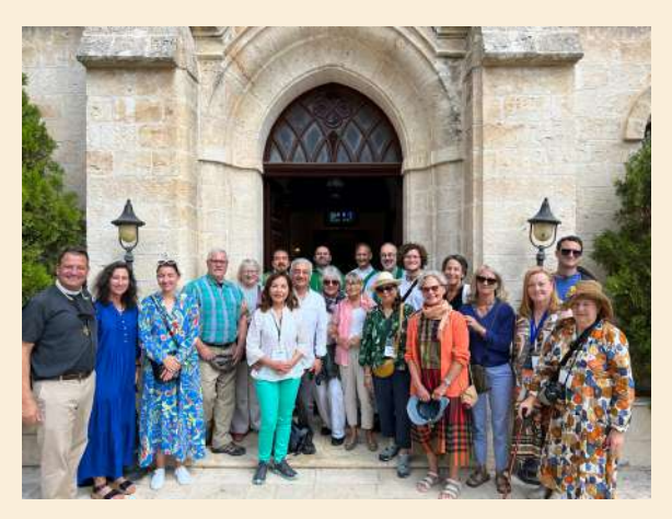
THE PILGRIMAGE GROUP IN NAZARETH ON OCTOBER 8

Providentially, three local friends with no hope of escaping the war pledged their help. They toiled through the night, finally securing us safe passage home. Crossing into Jordan, we recognized that we had encountered the Risen Lord – not in prayer but in the person and kindness of friends whose love enabled us to be safe and free. Our hearts were bursting with gratitude.