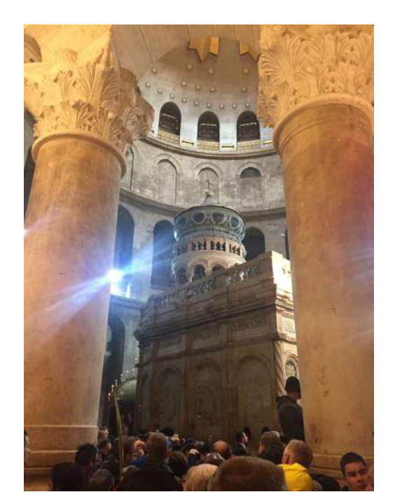
CHURCH OF THE HOLY SEPULCHRE, JERUSALEM

To be part of the Episcopal Church in Europe is to be part of our church that lives closest to the places where the horrors of the Holocaust unfolded against the Jewish people. It is to live among cities once destroyed by actions of collective punishment and wanton destruction of civilian life. It is to live with the world's largest communities of Muslim people outside the Islamic world as our neighbors. And it is to see, every day, new acts of anti-Semitic and anti-Islamic hate and intolerance.