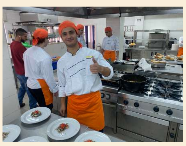
RAMALLAH HOTEL SCHOOL STUDENT

Students at the Episcopal Training Center in the West Bank also trapped in the tension