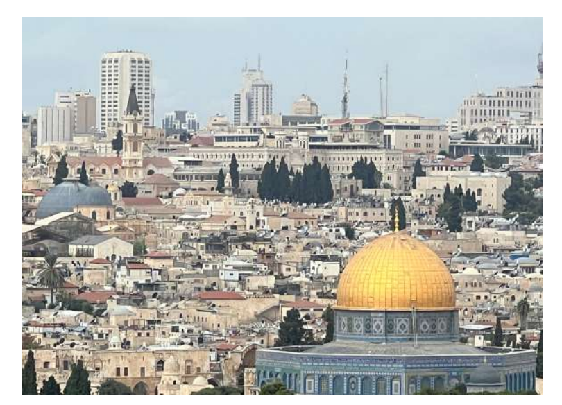
DOME OF THE ROCK AL AQSA MOSQUE IN JERUSALEM

So, too, the Church has been consistent in its explicit denunciation of terrorism, in both the international and domestic spheres. It has called for the study of the pastoral needs of those traumatized by terroristic violence, and for the deeper examination of how historic principles of just-war theory should guide responses to the threats posed by terrorism.