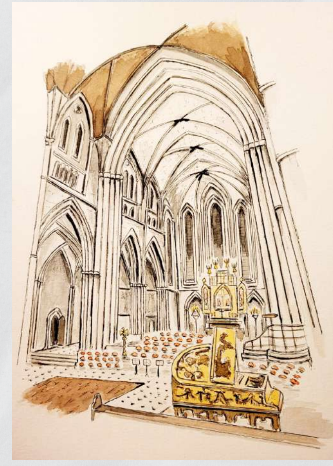
PAINTING BY CHLOÉ PASSE