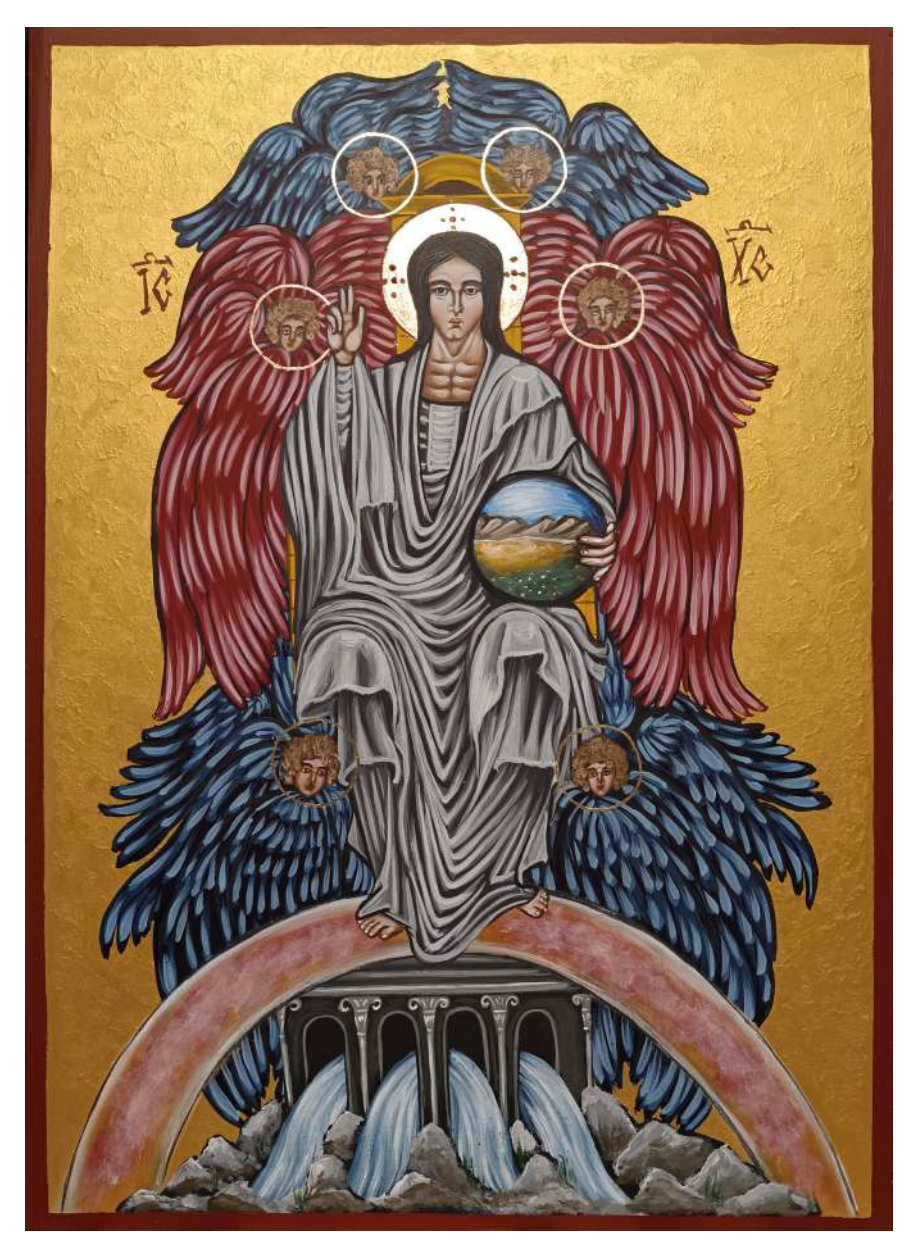
CHRIST ENTHRONED IN HEAVENLY JERUSALEM. GIFT OF ARTWORK, BASED ON BURNE-JONES MOSAICS IN APSE OF ST. PAUL'S-WITHIN-THE-WALLS

"It has been the honor of my lifetime to serve with the talented and faithful clergy of the Convocation for these past 12 years, and to be part of the growth and life of St. Paul's and the JNRC."